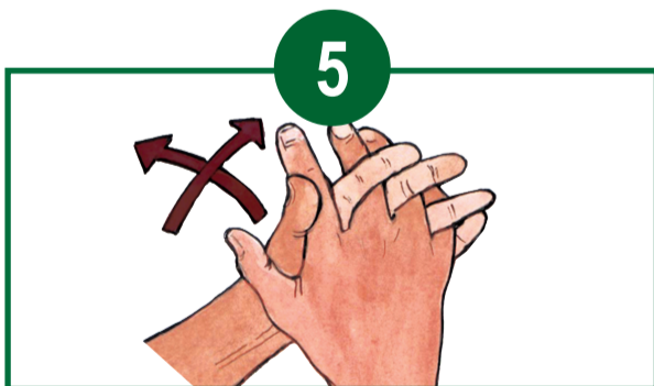
Rub fingers between each other.