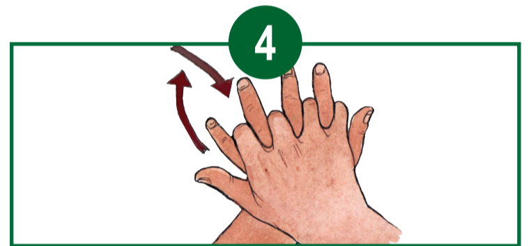
Place one hand over back of other, rub between fingers. Swap hands.