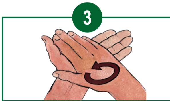
Rub palms together.