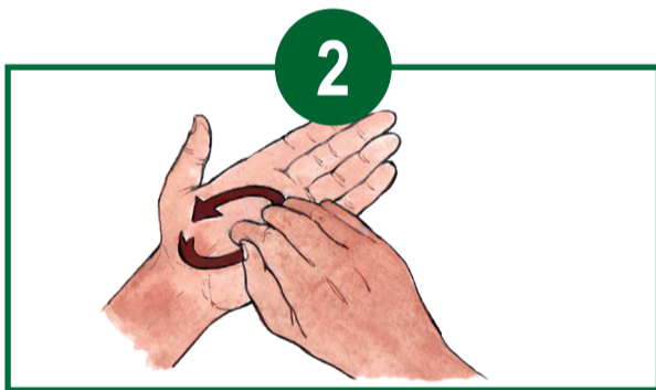
Rub tips of nails against palm. Swap hands.