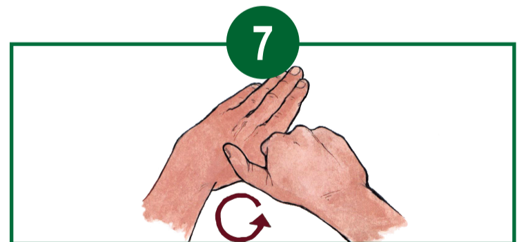
Rub each thumb with opposite palm. Swap hands.